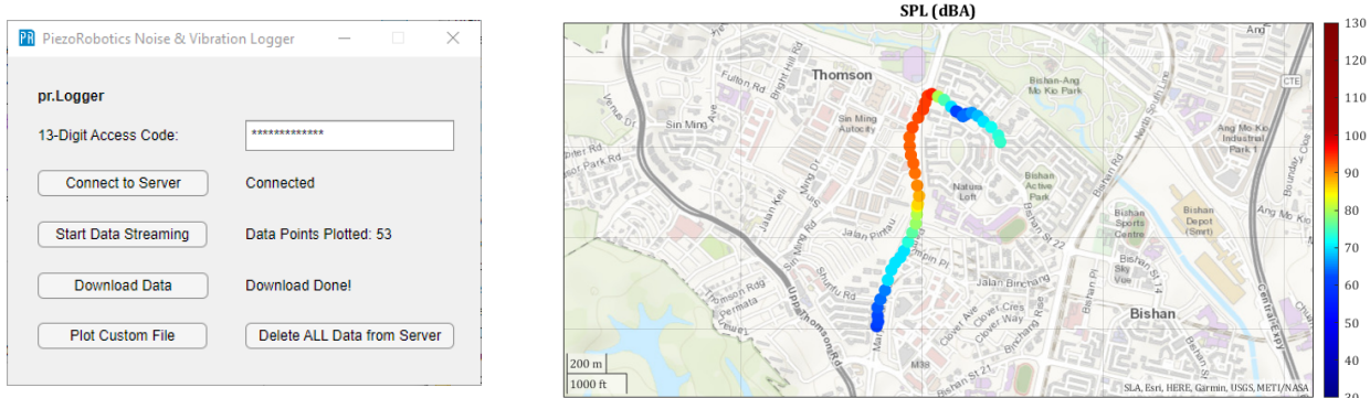
Figure 1. Dashboard software and example of a geospatial noise level map in Singapore

Our dashboard software was developed to securely connect to the server and plot the measured noise and vibration data live, as they are being acquired, in a user-friendly geospatial map.